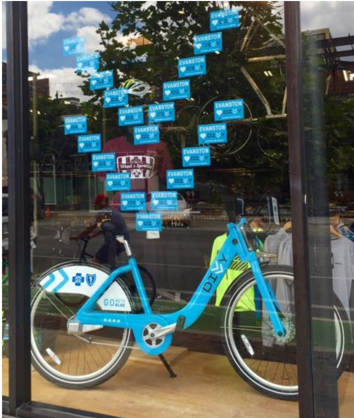
Divvy bike on display at local bike shop Wheel & Sprocket during program's launch